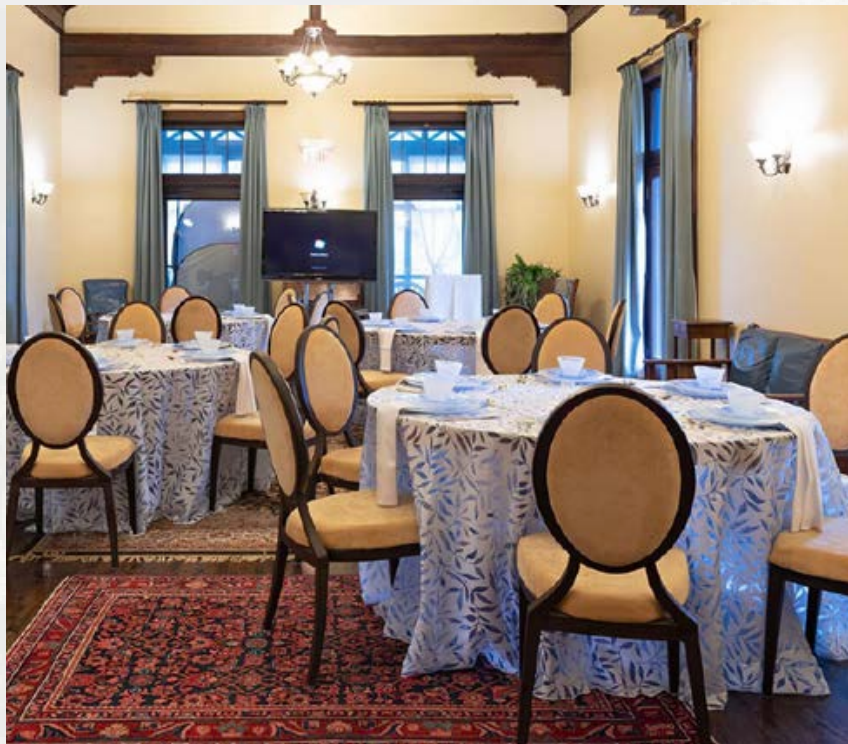
THE GREAT ROOM