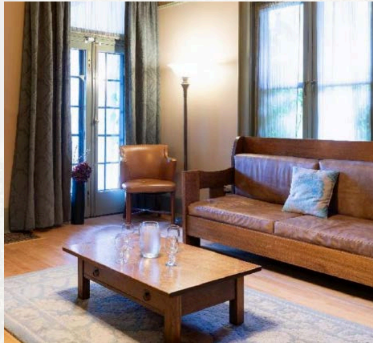
THE HIGHLAND ROOM